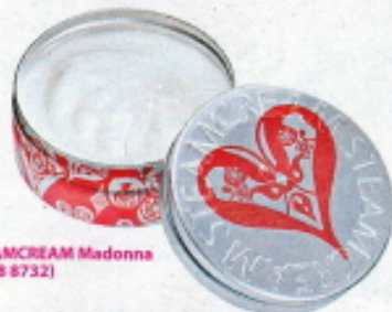
STEAMCREAM Madonna (2268 8732)