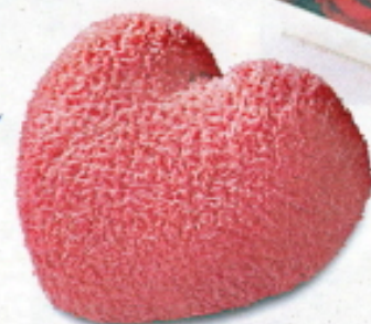
Earth-Apple preserved rose gift set (available at Seibu Admiralty)

Tel: 2822 8524 Website: www.kingfook.com