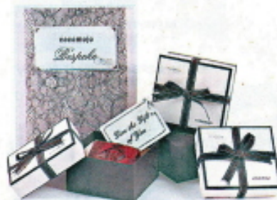
COCOMOJO Amy Mini Crossbody with BESPOKE service (2203 4013)