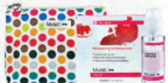
Murad Perfect Pairs (2317 1009)