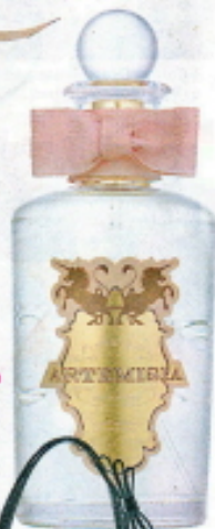
Penhaligon's Artemisia fragrance for women (2558 9800)