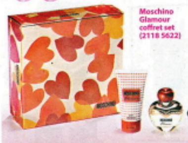
Moschino Glamour coffret set (2118 5622)

No doubt you want to pamper your lady on this special day, but with an ocean of gift choices available, it can be quite a headache. Why not take a look at these items we carefully selected?