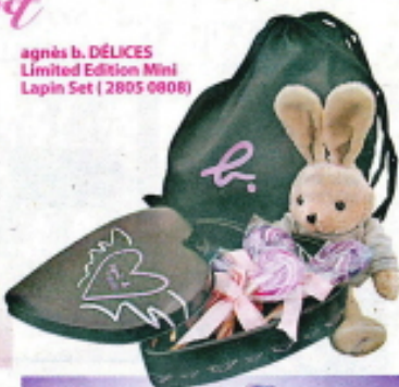
agnès b. DÉLIKES Limited Edition Mini Lapin Set (2805 0808)