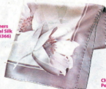
Brooks Brothers Portrait Floral Silk Scarf (2523 3366)