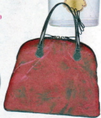
Valentino Garavani Valentine's special handbag (2907 2332)