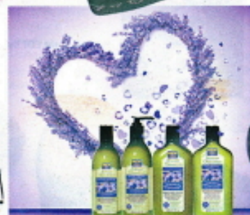
Avalon Organics Nourishing Lavender Collection (available at selected Watsons)