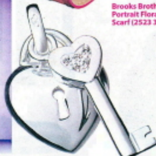
Links of London Valentine's Edition Locket and Key Charm (2295 3328)