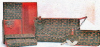
FENDI Saint Valentine's Collection (2524 1339)